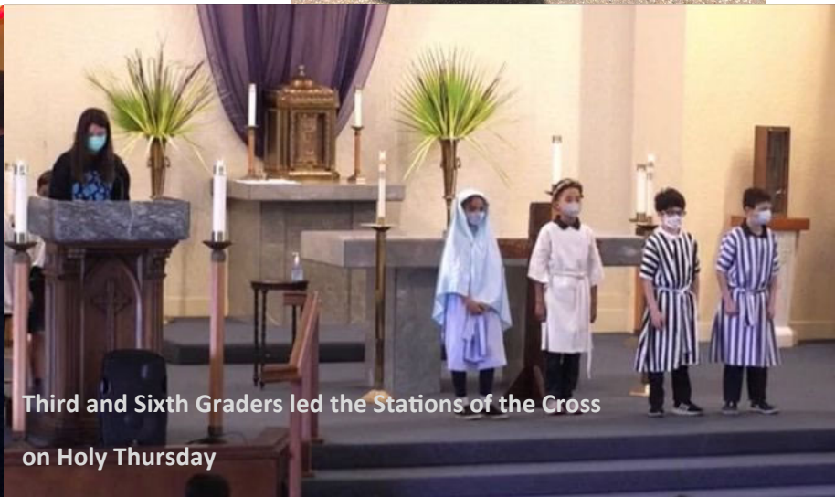
Third and Sixth Graders led the Stations of the Cross on Holy Thursday