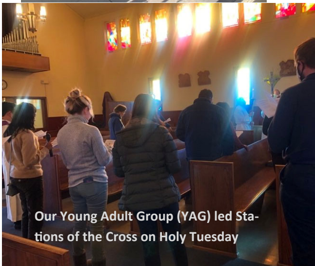
Our Young Adult Group (YAG) led Stations of the Cross on Holy Tuesday