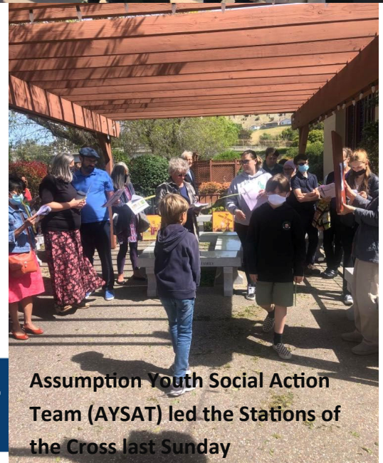
Assumption Youth Social Action Team (AYSAT) led the Stations of the Cross last Sunday