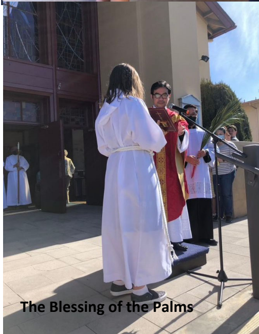
The Blessing of the Palms